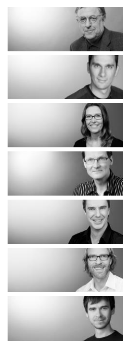
SEnerCon's FINESCE Team

iESA: 80,000 interactive Energy Savings Accounts